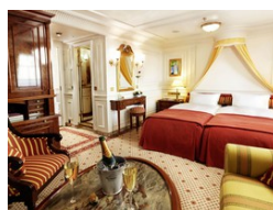
Category C. From