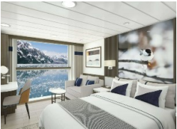
Aurora Stateroom Superior