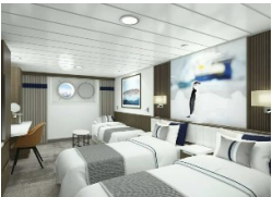
Aurora Stateroom Triple