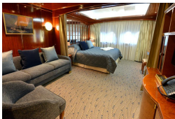
Byrd Deck Superior Sole