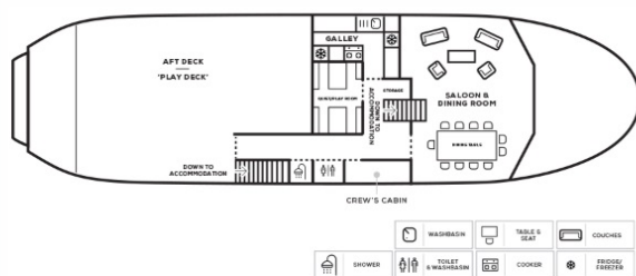
Accommodation Layout - Lower Deck