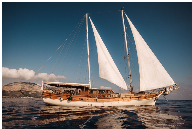
Deckhand & Steward

download limits. Amenities: Sailing equipment, snorkeling sets, kayaks, fishing rods, paddle boards, TV, DVD, music system, card games Crew: Captain, Chef,