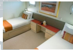
Ocean/River Premium Cabin