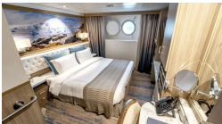
Balcony Stateroom - A Balcony Stateroom - B