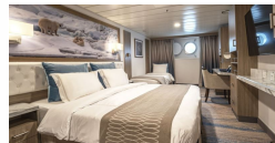
Aurora Stateroom Triple Share