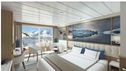
Balcony Stateroom Category C Captain's Suite