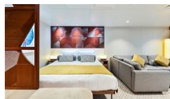
Coral Deck Stateroom