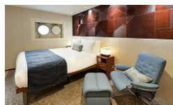
Explorer Deck Balcony Stateroom