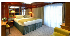
Magellan Deck Standard Single