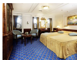
Category E. From