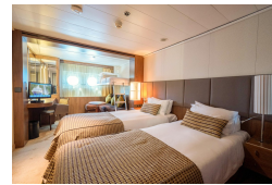
Deck 5 Superior