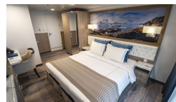
Balcony Stateroom Superior