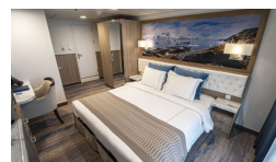
Balcony Stateroom Superior Captain's Suite