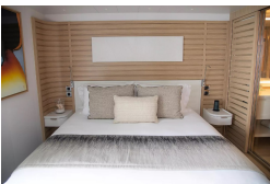
Deluxe Suite Deck 6