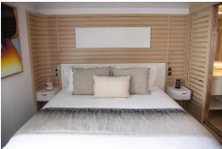
Deluxe Suite Deck 4