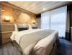
Studio Single Veranda Stateroom