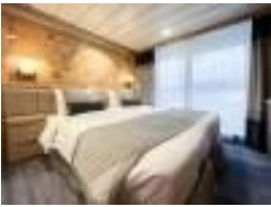
Studio Single Veranda Stateroom