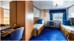
Cabin Category 6