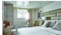
Cabin Category 2