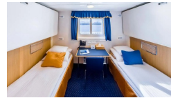
Cabin Category 5