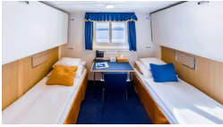
Cabin Category 5 Cabin Category 6 Cabin Category 7 Cabin Category 8 Cabin Category 9 Cabin Category A