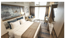
Balcony Stateroom - B