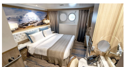
Balcony Stateroom - A