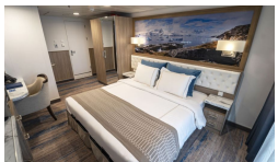
Balcony Stateroom - C