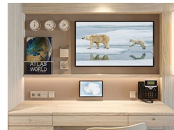
Category B Solo