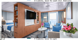
Category B Suite - Balcony Suite