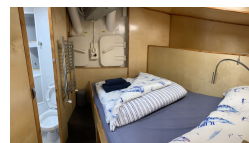
Twin / Double Cabin En-suite