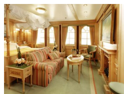
Category B. From