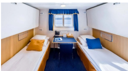
Cabin Category 5