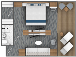
Category B Suite - Balcony Suite