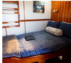
Cabin - Category 2, Option 2