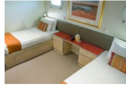
Ocean/River Premium Cabin