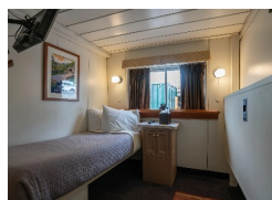
Compass Cabin Single