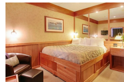
Jr Commodore Suite