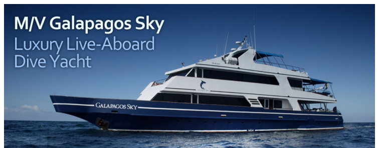
M/V Galapagos Sky Luxury Live-Aboard Dive Yacht