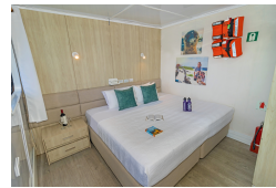
Upper Deck Twin