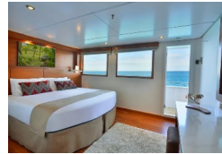
Category 04. From