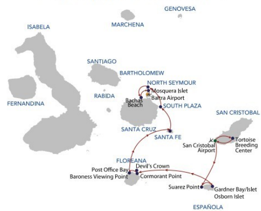
6-day Galapagos Cruise Itinerary "A"

Explore the unparalleled wildlife and dramatic landscapes of the Galapagos Islands on this 6-day Sea Star cruise. From the towering cliffs and breeding grounds of Española to the unique flora and giant tortoises of San Cristobal, each day offers opportunities for hiking, snorkeling, kayaking, and close encounters with remarkable wildlife. Witness colonies of sea lions, colourful marine life, and iconic birds such as blue-footed boobies and waved albatrosses, while exploring pristine beaches, volcanic formations, and historic sites across multiple islands.