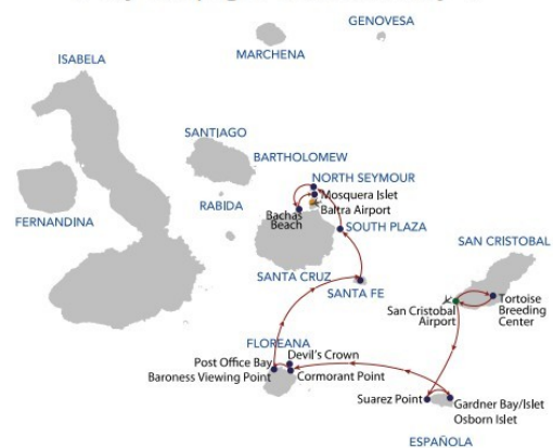
6-day Galapagos Cruise Itinerary "A"

Explore the unparalleled wildlife and dramatic landscapes of the Galapagos Islands on this 6-day Sea Star cruise. From the towering cliffs and breeding grounds of Española to the unique flora and giant tortoises of San Cristobal, each day offers opportunities for hiking, snorkeling, kayaking, and close encounters with remarkable wildlife. Witness colonies of sea lions, colourful marine life, and iconic birds such as blue-footed boobies and waved albatrosses, while exploring pristine beaches, volcanic formations, and historic sites across multiple islands.