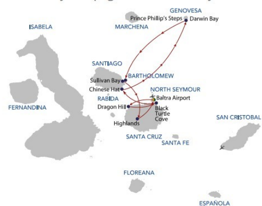
5-day Galapagos Cruise Itinerary "B"

Discover the natural and volcanic wonders of the Galapagos on this 5-day Sea Star cruise through Santa Cruz, Santiago, Genovesa, Bartholomew and San Cristobal Islands. Encounter iconic wildlife including land and marine iguanas, sea lions, penguins, boobies and reef sharks. From the lush highlands of Santa Cruz to the surreal lava landscapes of Santiago, this voyage offers a perfect balance of adventure, wildlife encounters, and breathtaking views.