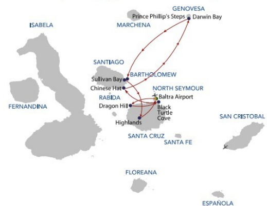
5-day Galapagos Cruise Itinerary "B"

Discover the natural and volcanic wonders of the Galapagos on this 5-day Sea Star cruise through Santa Cruz, Santiago, Genovesa, Bartholomew and San Cristobal Islands. Encounter iconic wildlife including land and marine iguanas, sea lions, penguins, boobies and reef sharks. From the lush highlands of Santa Cruz to the surreal lava landscapes of Santiago, this voyage offers a perfect balance of adventure, wildlife encounters, and breathtaking views.