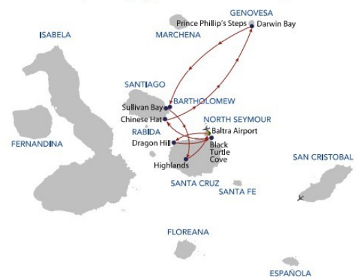
5-day Galapagos Cruise Itinerary "B"

Discover the natural and volcanic wonders of the Galapagos on this 5-day Sea Star cruise through Santa Cruz, Santiago, Genovesa, Bartholomew and San Cristobal Islands. Encounter iconic wildlife including land and marine iguanas, sea lions, penguins, boobies and reef sharks. From the lush highlands of Santa Cruz to the surreal lava landscapes of Santiago, this voyage offers a perfect balance of adventure, wildlife encounters, and breathtaking views.