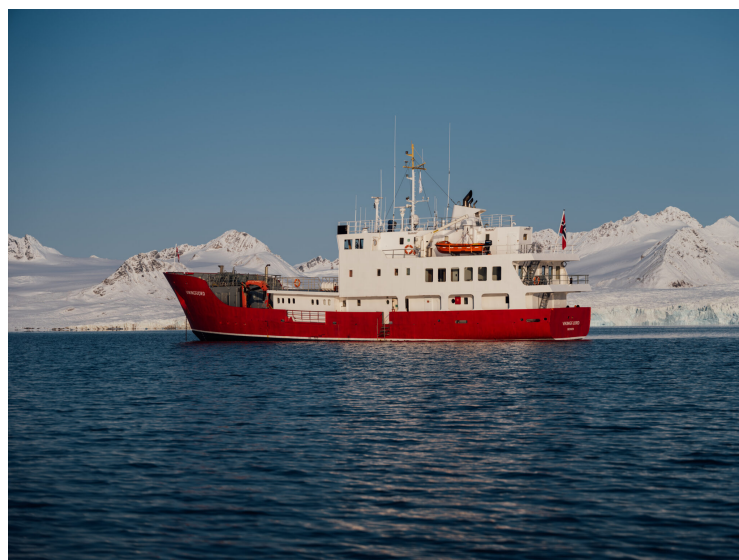
Accessible bow deck.

Equipped with 2 x Zodiac landing crafts for shore landings · Fully staffed with experienced captain, crew and expedition leaders. Interior · Large open plan guest area with lounge, dining and seating area located at the stern. Equipped with TV for presentations, mini bar and hot drink service. · Observation lounge area with seating area on the bridge. · Spacious cabins with ensuite toilet and shower. · Large mudroom and storage spaces for skis, and equipment. Exterior · Outdoor hot tub and sauna with a view on Deck 2. · Large viewing area on the bow. · 4 open decks for lots of viewing options. ·