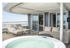
Prestige Stateroom Deck 4