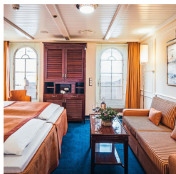
Category D. From