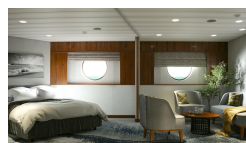
Arctic Superior. From