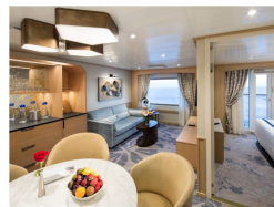
Gracious Ocean View Suites