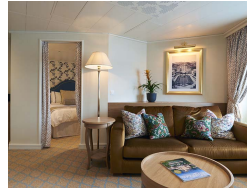
Deluxe Suite - from