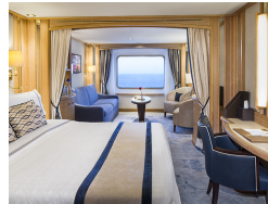
Ocean View Suite - from