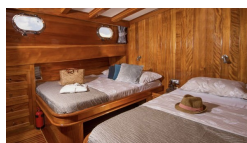
Grand Master Cabin