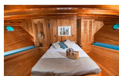
Superior Double Cabin