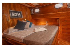
Superior Twin Cabin