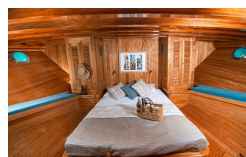
Superior Double Cabin