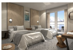
Deluxe Veranda Cabin PH Suite