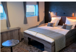
Triple Porthole Twin Porthole