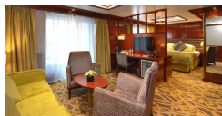
Explorer Deck Owner's Balcony Suite