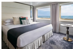
Category 01. From