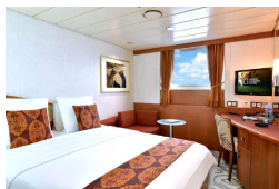
Category 1. From