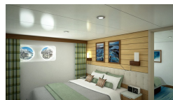
Category 2. From