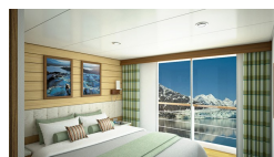
Category 5. From