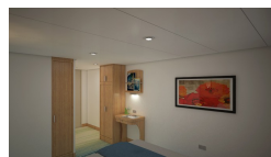
Category 4. From