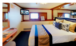
Orchid Cabins - Twin Share