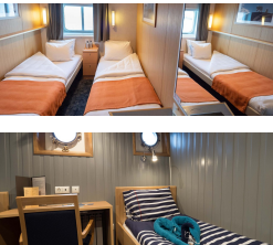
Twin Cabin Sole