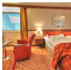
Expedition Suite. From