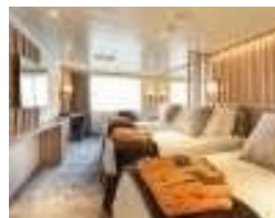
Deluxe Balcony Suite