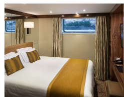
Category E Douro Deck - From