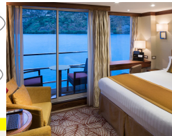
Category C Porto Deck - From